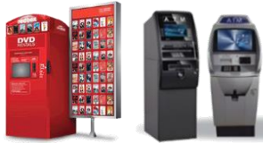
ATMs and Kiosks